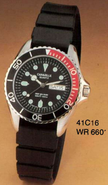
41C16 WR 660'